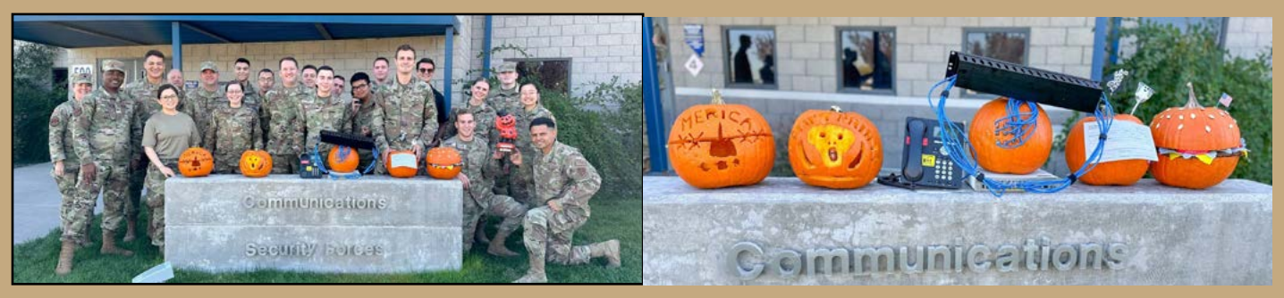
The Communications Flight held their annual Pumpkin Carving Contest last drill weekend. The Radio Shop came in for the WIN--with their Punkin Burger. Congratulations Radio Shop!!